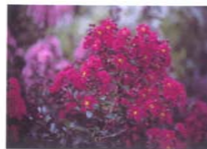
Lagerstromia 'Centennial Spirit' - Dark red (does not fade). Bloom period to 110 days. Grows 10-20' upright. Reduced tendency to sucker. Not susceptible to aphids, some resistance to mildew. Smooth bark. Flowers begin in late June. Fall foliage is red-orange.