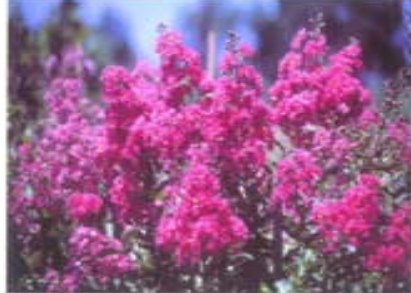
Lagerstromia Tuscarora' - Dark coral pink. Bloom period to 70 days. Grows 20' plus, vase broad crown. High mildew resistance and aphid prone. Modest winter hardiness. Mottled light brown bark. Massive early flowering but lower levels to follow. Fall foliage is orange to red.