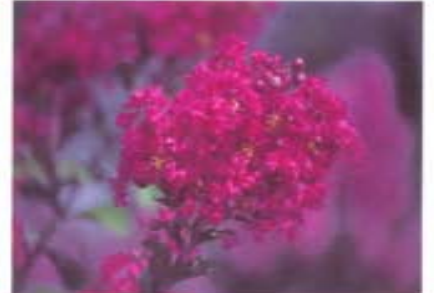
Lagerstromia Watermelon' - Large, vivid red, long lasting flowers Grows to 20-25'. Mildew tolerant. Flowers begin in early July. Fall foliage is golden.