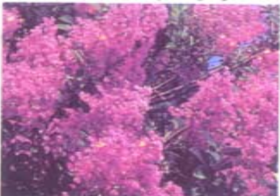
Lagerstromia 'Miami' - Dark Pink. Bloom period to 100 days. Grows 20' plus, upright. Tolerant to mildew. Slow growth after cold injury. Mottled chestnut-brown bark. Flowers begin in early July, recurrent. Fall foliage is orange to dark russet.