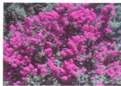
Lagerstromia Seminole' - Clear medium pink. Bloom period to 75 days. Grows 10-20', dense and globose. Mildew tolerant. Flowers begin early in mid June, recurrent. Fall foliage is yellow.