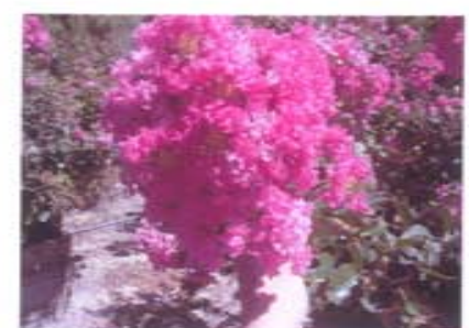
Lagerstromia 'Cherokee' - Brilliant red. Bloom period to 90 days. Grows 5-10' Compact. Resistance to mildew. Smooth bark. Flowers July to September. Often mislabelled in the trade.