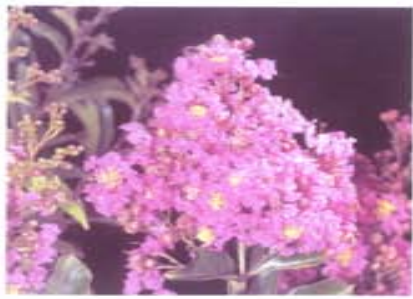
Lagerstromia Pecos' - Pink. Bloom period to 100 days. Grows 5-10', leggy and semi dwarf. Mildew resistance. Dark brown bark. Flowers are recurrent. Fall foliage is marron.