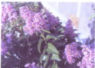
Lagerstromia 'Muskogee' - Light lavender. Bloom period to 120 days. Grows 20' plus, broad and tall. Strong branches. High mildew resistance. Gray-tan to medium brown bark. Flowers begin in mid June. Fall foliage is red and yellow.