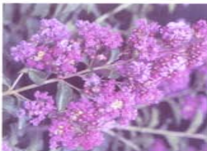
Lagerstromia Zuni' - Medium to dark lavender. Bloom period to 90 days. Grows 5-10', globose and upright. Mildew resistant. Flowers begin in early July, recurrent. Fall foliage is orange-red