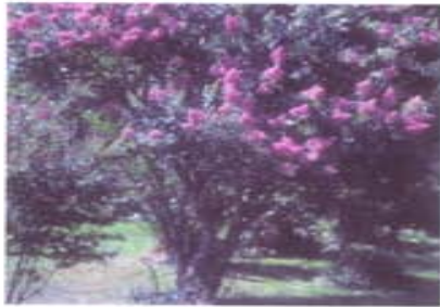
Lagerstromia 'Comanche' - Pink with orange tones. Bloom period to 100 days. Grows 10-20' tall, upright and globose. Mildew resistance. Light sandalwood bark. Flowers begin in early July. Fall foliage is deep red-purple.