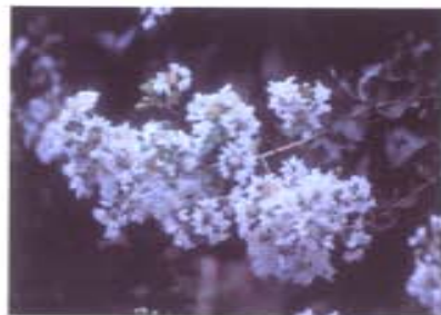
Lagerstromia 'Glendora' - Snow white. Bloom period approx 100 days. Grows moderately to 20-25', rounded crown. Flowers are long lasting.