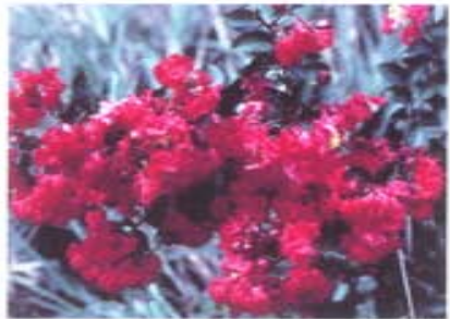
Lagerstromia TNT' - Dark red. Grows to 15-20', upright and spreading. Highly mildew resistant. Flowers begin in early July. Fall foliage is golden.