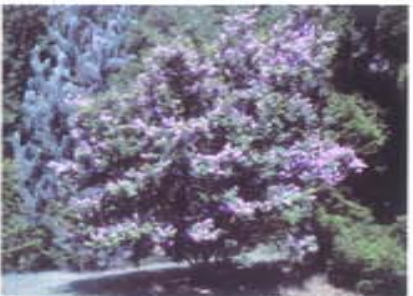
Lagerstromia Yuma' - Lavender. Bloom period to 90 days. Grows 10-20', densely branched when young and mature plant has open spreading crown. Good winter hardiness. Exfoliating mottled light gray bark. Flowers begin in July. Fall foliage yellow orange.