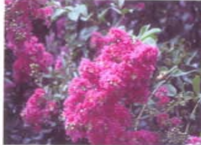
Lagerstromia Tuskegee' - Dark pink to red. Exceptional vigor. Bloom period to 100 days. Grows 10-20' broad and spreading. Mildew resistance. Exfoliating mottled gray-tan bark. Flowers are recurrent. Best used as an isolated specimen. Fall foliage is red-orange.