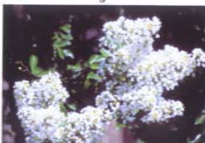
Lagerstromia 'Natchez' - White. Bloom period to 110 days. Grows 30' plus, broad and tall. Good winter hardiness. Mildew resistance. Cinnamon-brown bark is spectacular year round. Flowers begin in mid June. Fall foliage is red-orange.