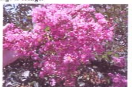
Lagerstromia 'Osage' - Clear, light pink. Bloom period to 100 days. Grows 10-20', open, rounded and spreading. Mildew resistance. Heavy flower production. Graceful habit. Flowers begin in late June. Fall foliage is red.