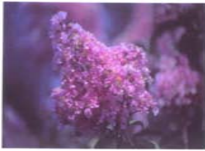
Lagerstromia 'Biloxi' - Pale pink. Bloom period to 80 days. Grows to 30' upright, vase shaped. Rapid grower Mildew resistant and winter hardiness. Exfoliating mottled bark. Flowers in mid-July, recurrent. Prone to have aphids. Fall foliage is purplish red.