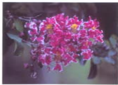
Lagerstromia Peppermint' - Deep pink with white edges. Bloom period average 100 days. Grows 15-20', upright. Good branching. Flowers begin in late June.