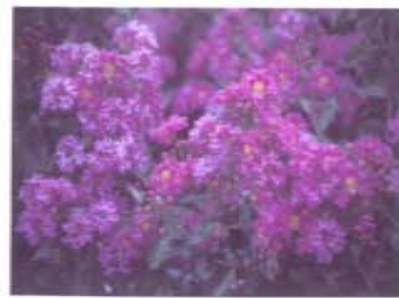
Lagerstromia 'Catawaba' - Medium to dark purple. Medium shrub 10-20' tall and wide, small dome shaped tree to 20'. Dence, compact and roundish in shape. Orange-red fall color. Mildew tolerant. Fall foliage is red-orange.