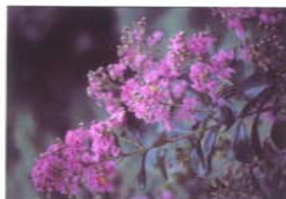
Lagerstromia 'Hopi' - Medium pink. Bloom period to 100 days. Grows 5-10' low and shrubby. Prone to mildew. Smooth bark. Flowers begin in late July to frost, recurrent. Fall foliage is red.