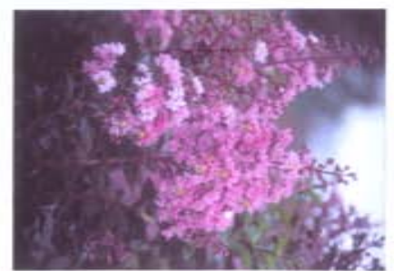
Lagerstromia Sioux' - Shocking dark pink. Bloom period to 90 days. Grows 10-20', dense and upright. Burgundy foliage. Mildew resistance. Exfoliating medium gray-brown bark. Flowers begin in mid July. Fall foliage is