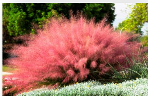
Muhlenbergia capillaris Plumetastic™