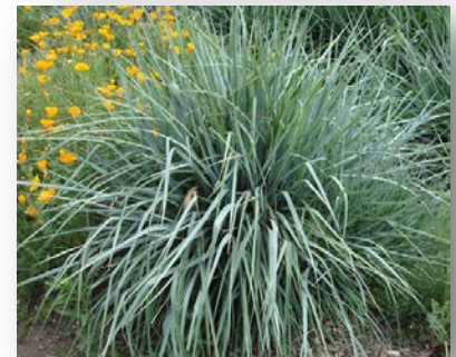
Elymus condensatus 'Canyon Prince'