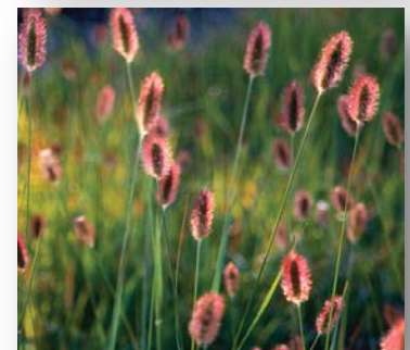
Pennisetum m. 'Red Bunny Tails'