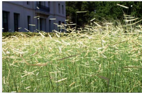
Bouteloua gracilis 'Blonde Ambition'