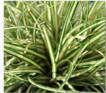
Carex h. 'Evergold'