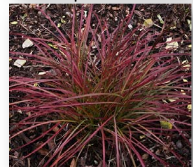
Miscanthus s. 'Little Miss'