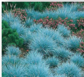
Festuca g. 'Elijah Blue'