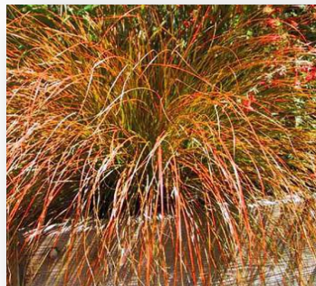
Carex testacea 'Prairie Fire'