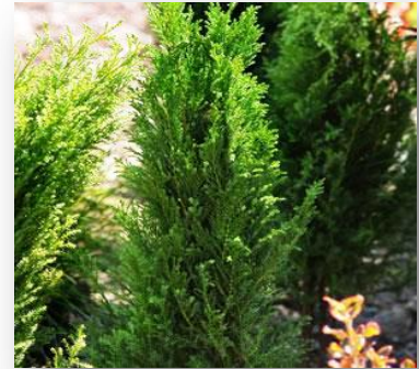
Cupressocyparis leylandii 'Shorty' PP 19618