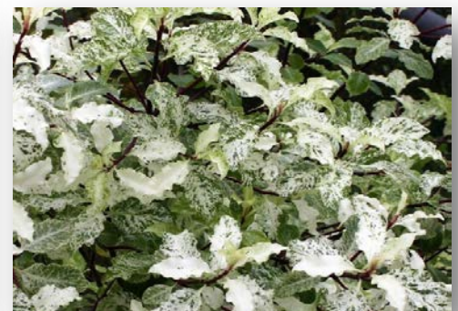
Pittosporum t. 'Irene Patterson'