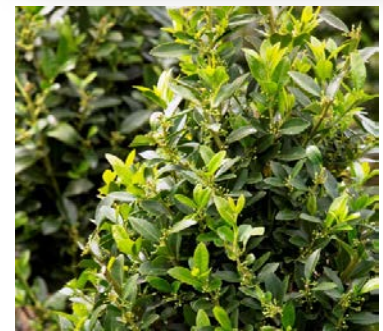
Ilex x Emerald Colonnade® PP 23905