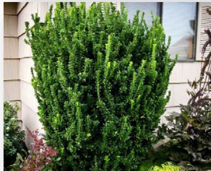
Euonymus japonicus 'Green Spire'