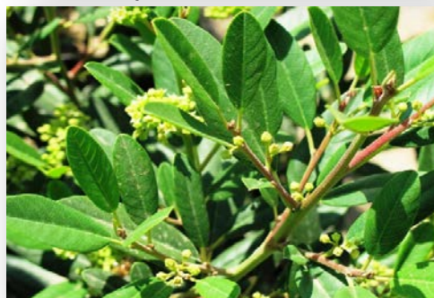
Rhamnus californica 'Eve Case'