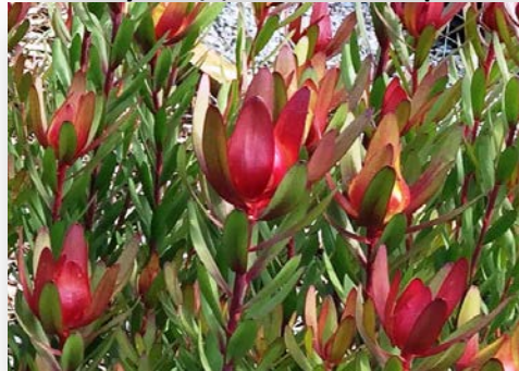
Leucadendron 'Safari Sunset'