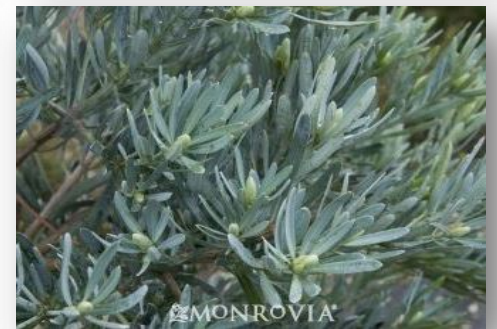
Podocarpus elongatus Icee Blue®