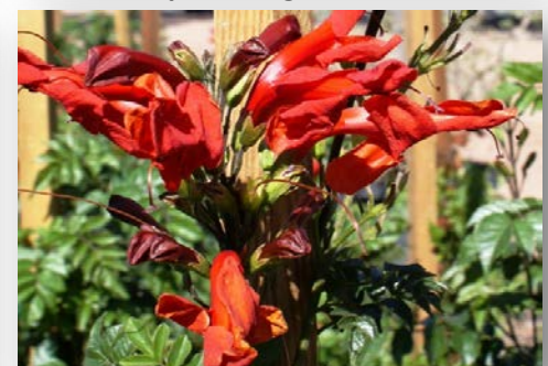
Tecomaria capensis 'Red Riot'